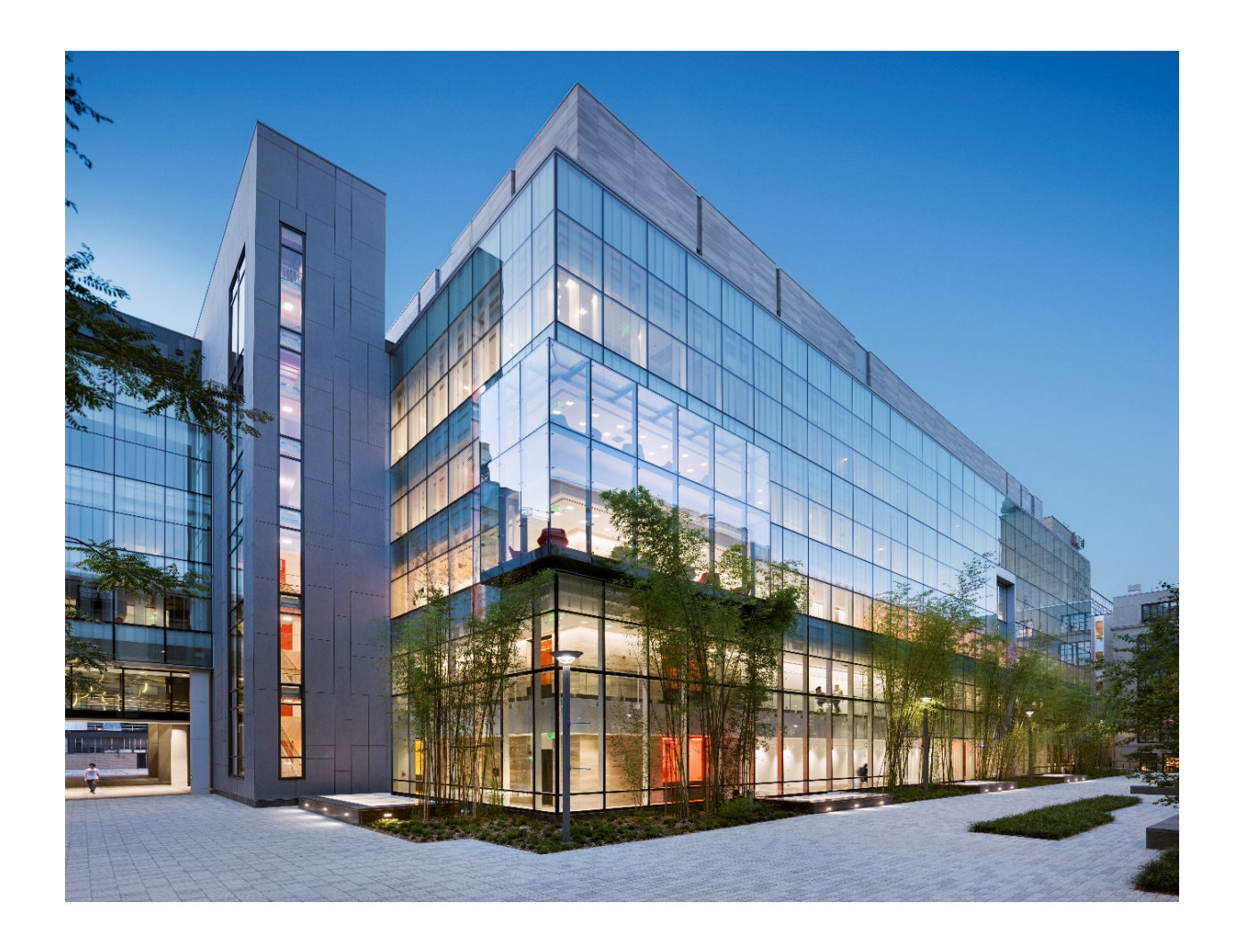
Sustaining members of the MIT.nano Consortium